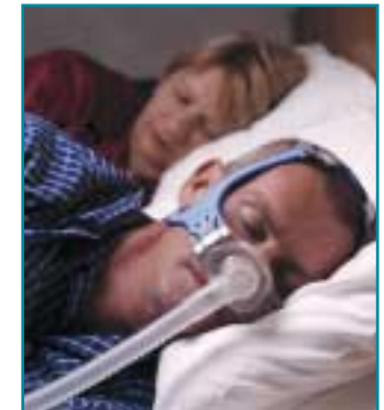
Comfortable yet stable—a great night's sleep for everyone