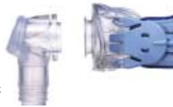
One Snap Elbow

The One Snap Elbow makes attachment and detachment of the mask and the air tubing quick and easy. This is especially convenient when you need to visit the rest room at night—just detach the elbow from the mask before you go and snap it on again when you return to bed.