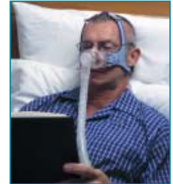
Watching TV or reading is easy with the Mirage Vista