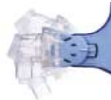
Fit Angle Selector

Mirage Vista is designed with easy-lock parts and more preassembled parts. Even if your vision is no longer 20/20, or if your fingers aren't quite as nimble as you may want them to be, you will find the Mirage Vista easier to put on, take off, clean, and handle than other masks.